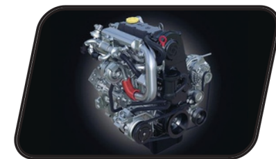
SUPERIOR 70 HP POWER & 170 Nm TORQUE