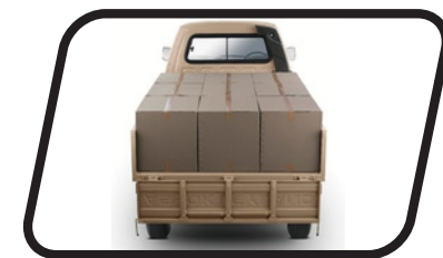
LARGE LOADING AREA